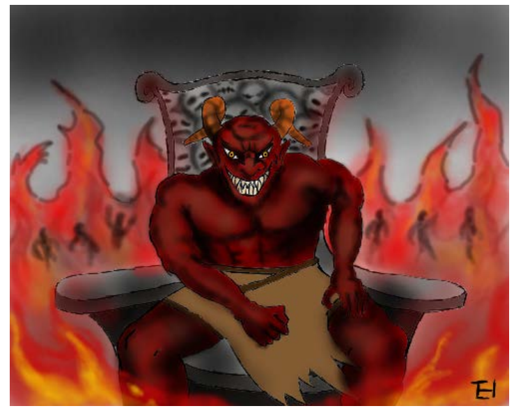
There is a cost for your sin!