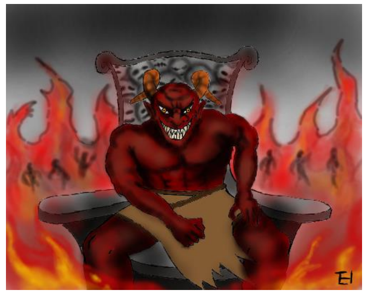
There is a cost for sin!

John 3:36 "...and he that believeth not the Son shall not see life; but the wrath of God abideth on him."